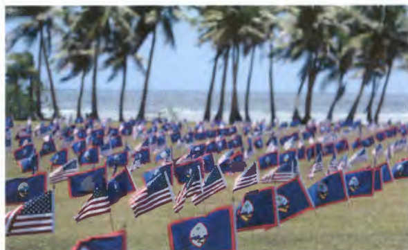
PDN FILE PHOTO Hundreds of U.S. and Guam flags are planted ahead of Memorial Day at the War in the Pacific National Historical Park in Asan on May 28, 2022.

Each of the 3,050 flags holds significance, representing either one of the 1,880 U.S. service members who lost their lives during the 1941 Japanese attack and the 1944 liberation battle for Guam or one of the 1,170 Chamoru people who perished during the war years on Guam,